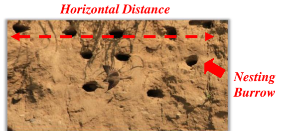
Example: Horizontal distance= 10 m #Nesting Burrows = 11